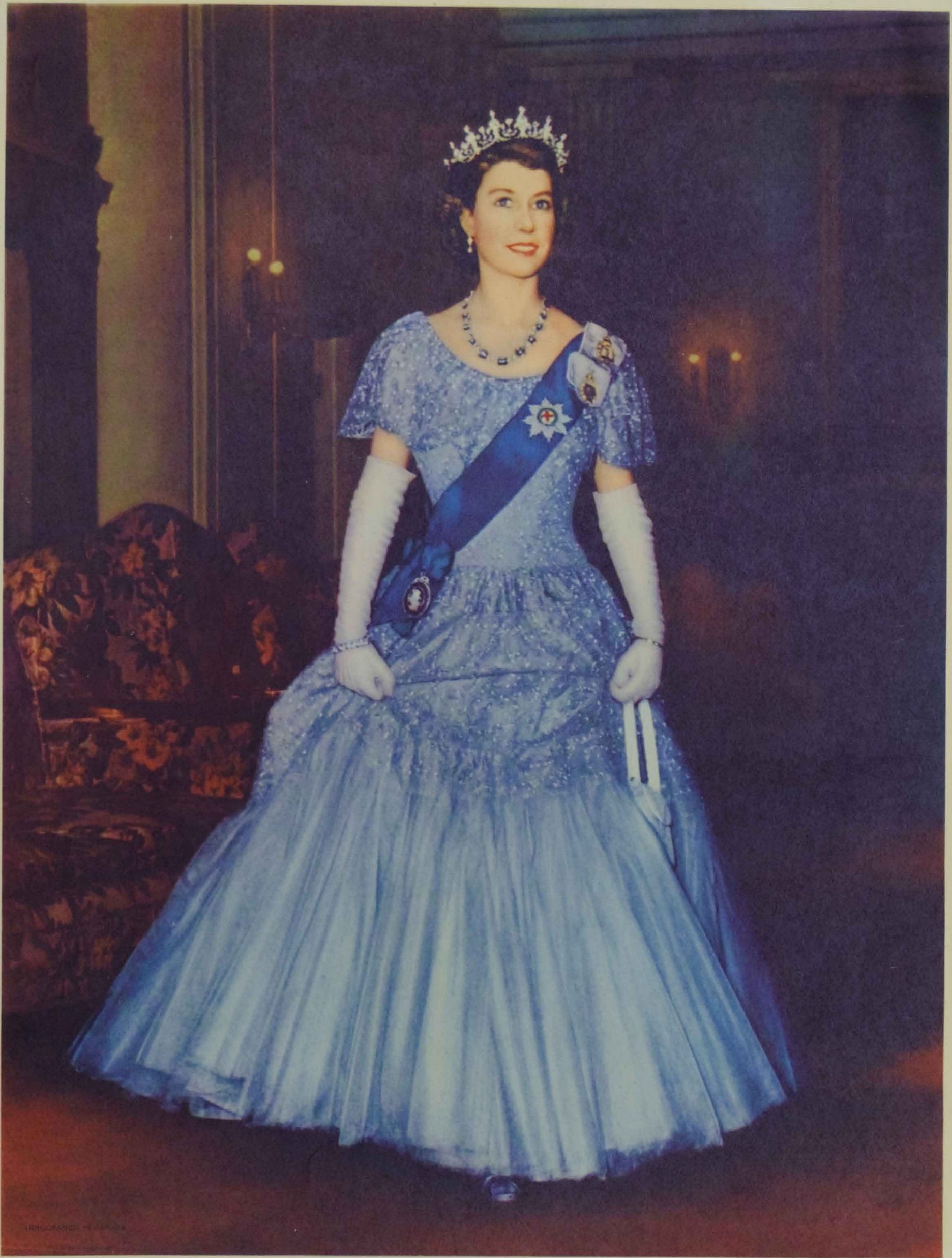
H. M. QUEEN ELIZABETH II