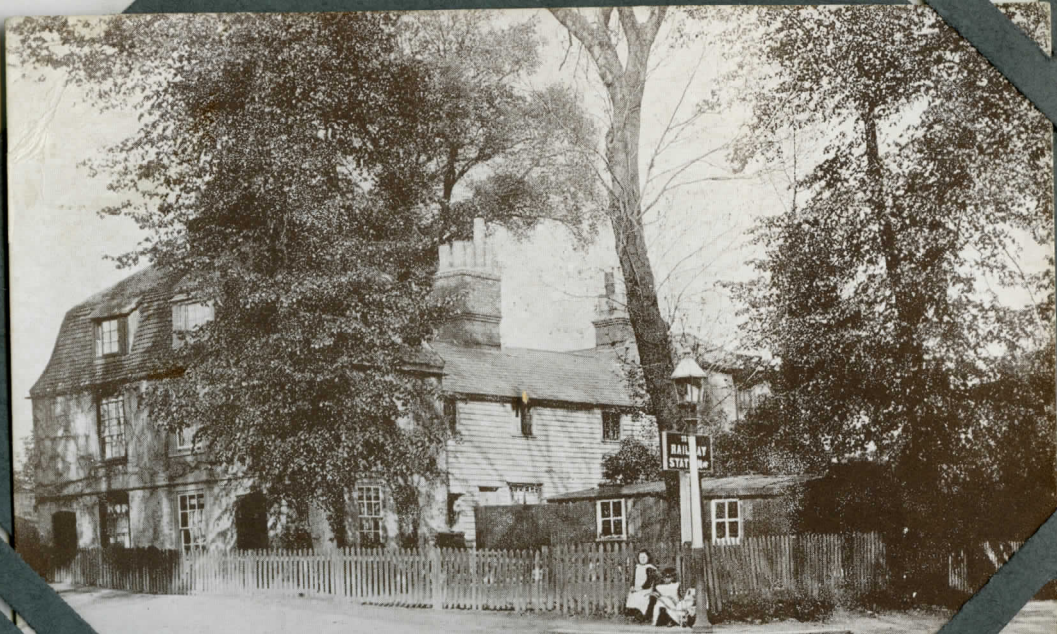
RAILWAY COTTAGE, EAST END ROAD, EAST FINCHLEY.